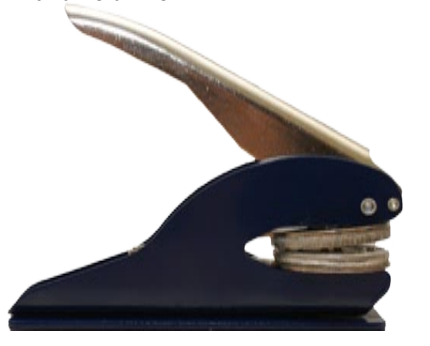
Hand Held Plier with Metal Base