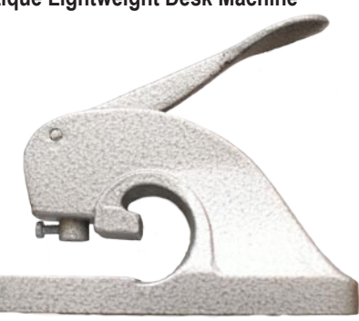
Silver Lightweight Desk Machine