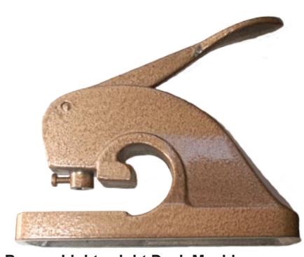
Bronze Lightweight Desk Machine