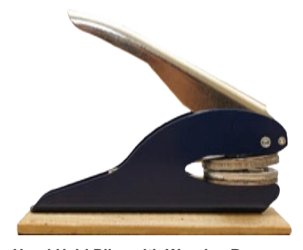
Hand Held Plier with Wooden Base