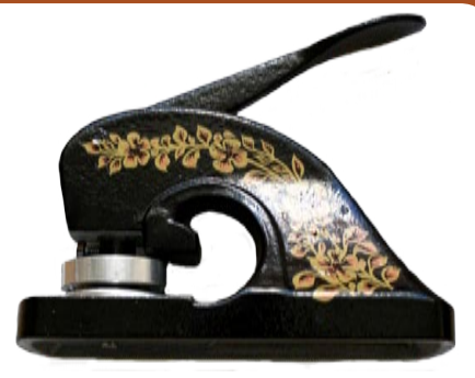
Antique Lightweight Desk Machine

(Both dies are made of quality metal for a long-lasting impression and not plastic)