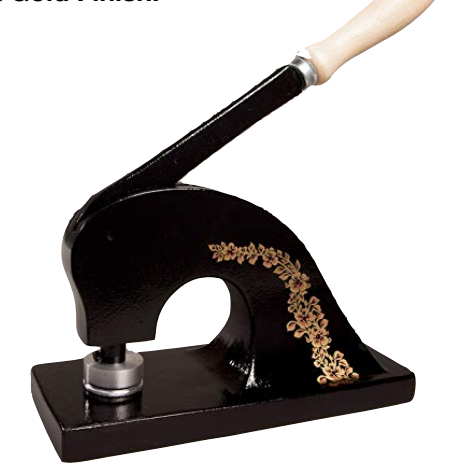
Additional per unit cost: £50+VAT.