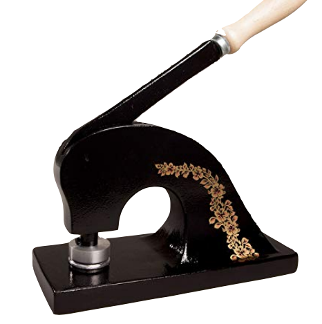
Additional per unit cost: £50+VAT.